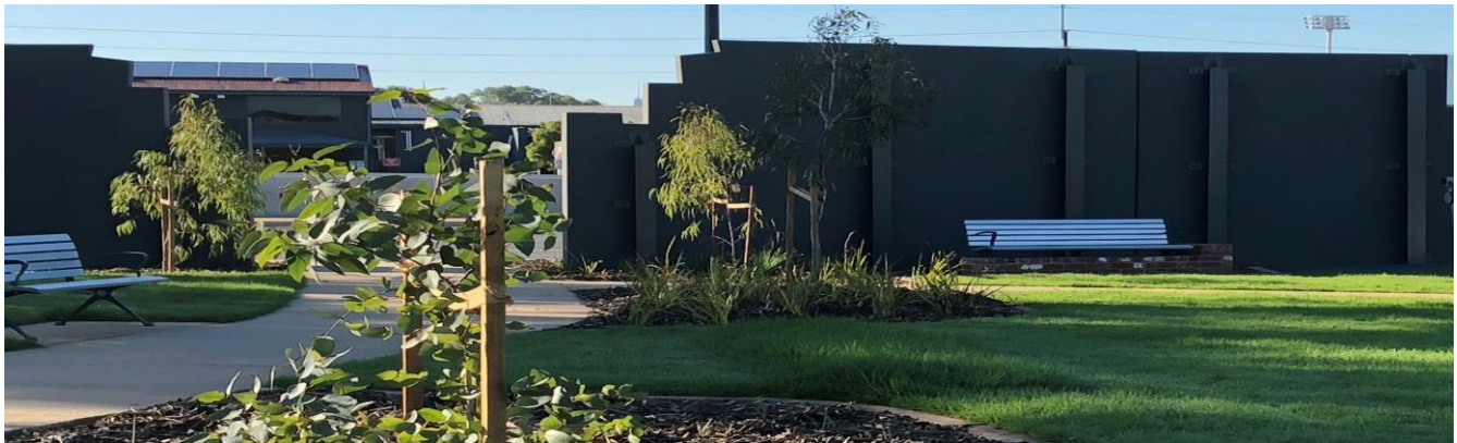
Jervois Avenue Park, May 2019