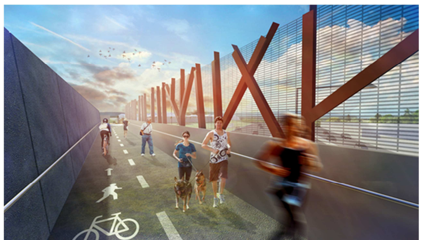
Artist impression of the Outer Harbor Rail Overpass shared use (pedestrians and cyclists) bridge

Pedestrians and cyclists are encouraged to contact the project team, should they require assistance during construction.