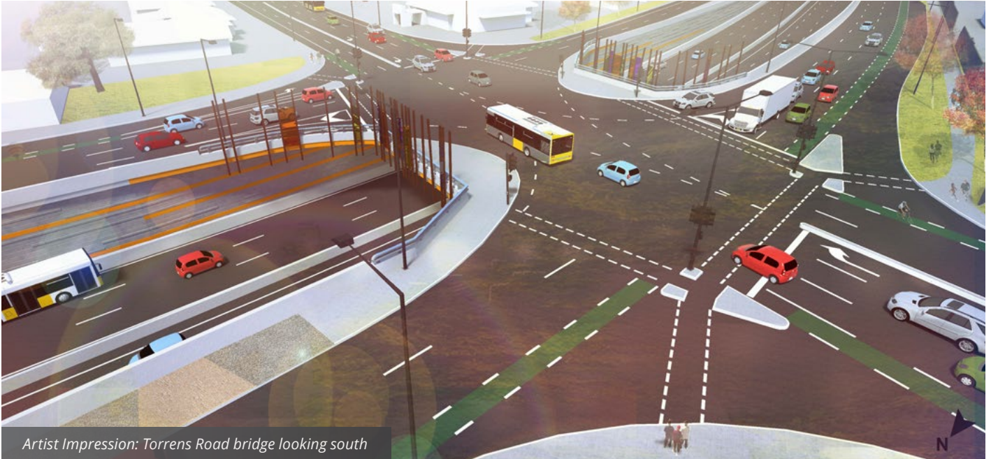
Artist Impression: Torrens Road bridge looking south

As part of the Torrens Road to River Torrens (T2T) Project, traffic will be switched on to the new north bound surface road on South Road between Torrens Road and Tait Street.